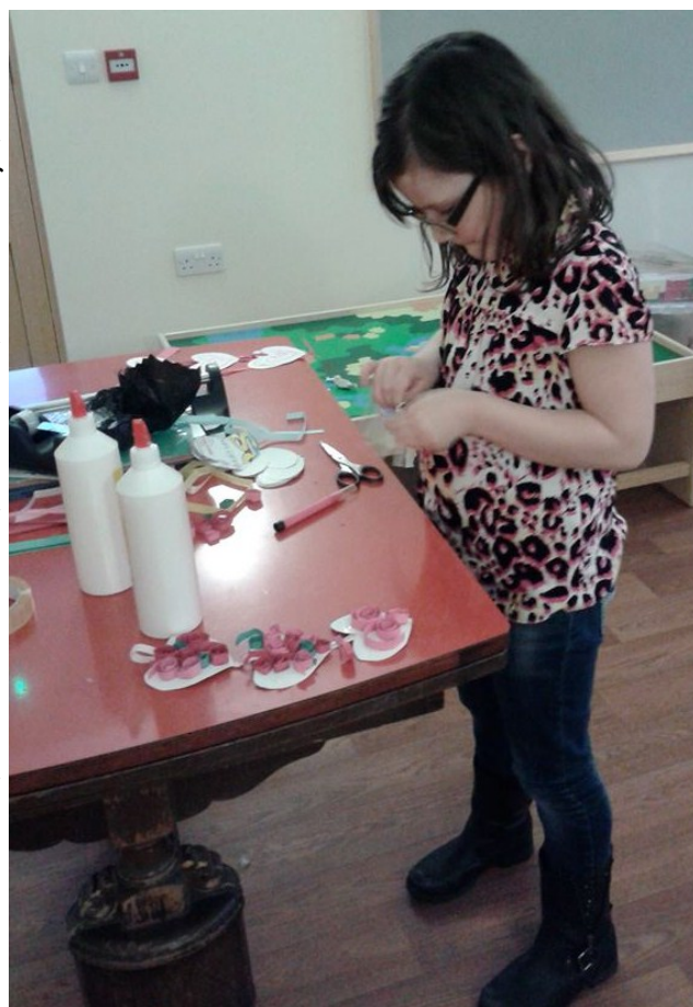
Scene from Messy Church